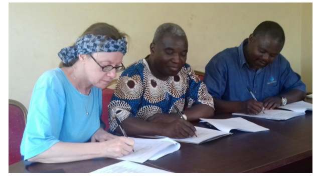
Meeting with Architects of Atelier & Other and winning contractor PBM Construction: signing of tender contract.