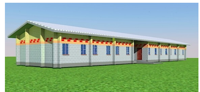
Library / science block