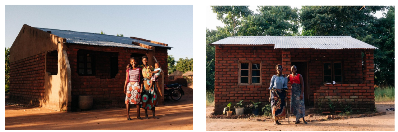
One of our students (left) with her baby and her mother (I) and one of our students with her disabled mother (r).

Malawi is one of the poorest countries of the world. Mganja, a group of villages in the Traditional Authority Chief Kachindamoto, Dedza District, is a poor, agricultural area, with no job possibilities other than selfsubsisting and cash crop farming. The Mganja population comprises around 6,000 people. All the surrounding Secondary Schools are too far to travel to on a daily basis. Pupils had to go boarding elsewhere. This presented two problems: firstly, the parents had great difficulty to find money to send their children boarding, secondly many girls got pregnant while boarding and lost their chance at a Secondary School education. In 2015 66 girls in the age 13-19 in the Mganja area got pregnant.