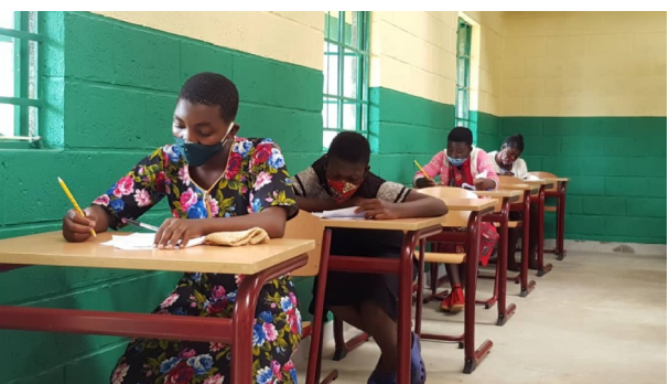
girls writing entrance examination January 2021