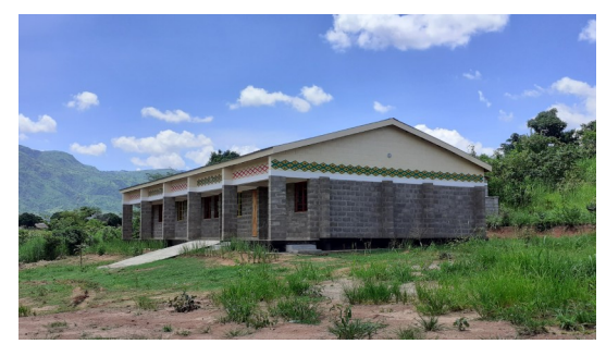
Semi-detached staff house (2 houses):