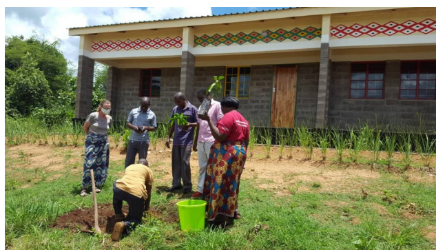
The team of teachers planting mango trees