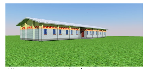
Library and science block

The Ministry of Education made it clear that a library and science block are compulsory for the school. Therefore we added this block to the budget plan. As we will start with only form 1, we can exchange a school block for the library and science block, adding the school block later. This depends on the outcome of the tender.