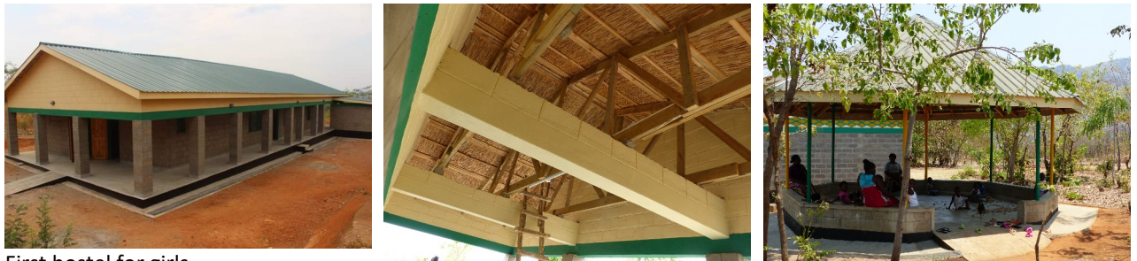
First hostel for girls