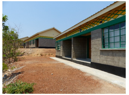
Junior staff house: 2 smaller staff houses