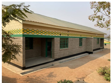
Block number 3: 2 staff houses

right hand side. The contractor finished all the works. We are hopeful that he can return soon to start construction of a second hostel.