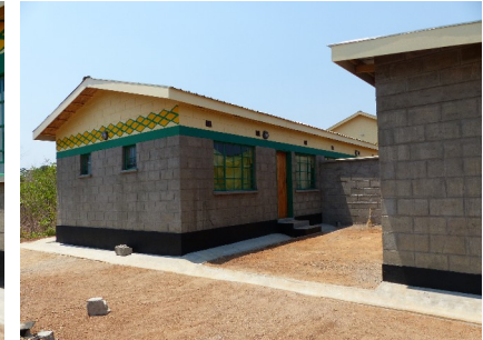
One of the junior staff houses seen from the rear