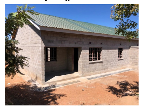
Block 3 of 2 staff houses: 2 teachers with a family each