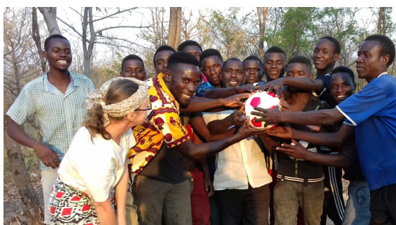
After finishing clearing the boundary the football was received with joy.

The land has been officially purchased. Beacons have been put in place. The boundary (1,230 meter) has been cleared with the assistance of three football teams of Mganja, each team given a good football for their work. The football teams have also dug holes every three meters. As soon as the rainy season starts (November / December) we will plant trees all around the border of the project site.