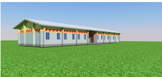
Library and science block

The Ministry of Education made it clear that a library and science block are compulsory for the school. Therefore we added this block to the budget plan. As we will start with only form 1, we can exchange a school block for the library and science block, adding the school block later. This depends on the outcome of the tender.